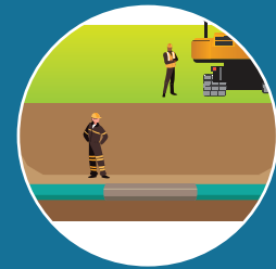
Hi-Grade Steel & Protective Coatings